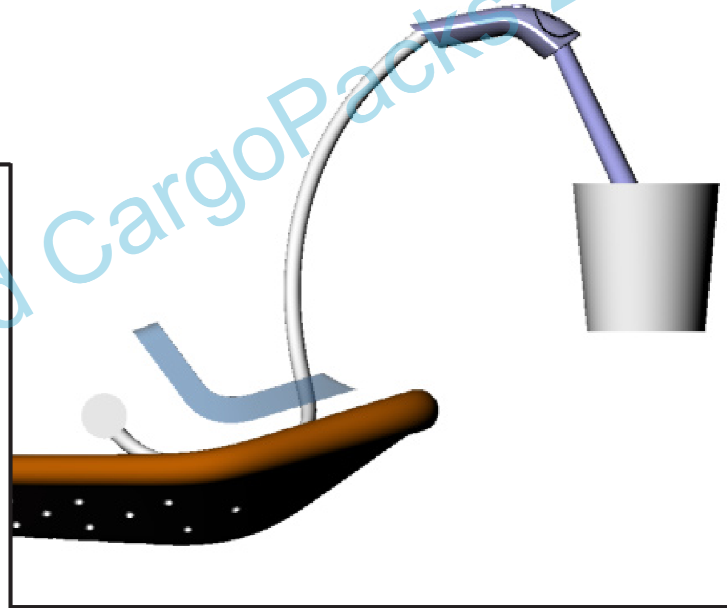
push to get fresh drinking water